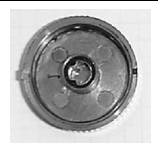
HH-1969 Flat of shaft and Marker on same side of knob.