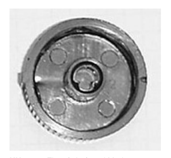
HH-1970 Flat of shaft and Marker 90° apart.

HH-1969 to be used with RED or OCHRE GSI/DMC Decals.